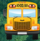
JOHNSONS BUSES INC, PETOSKEY