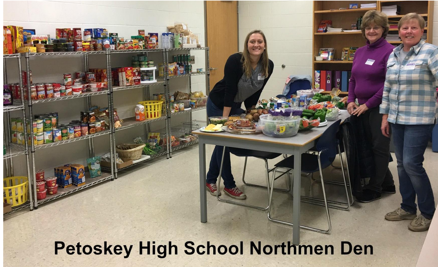
Petoskey High School Northmen Den