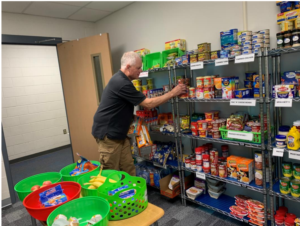
Full Shelves – Friday Opening